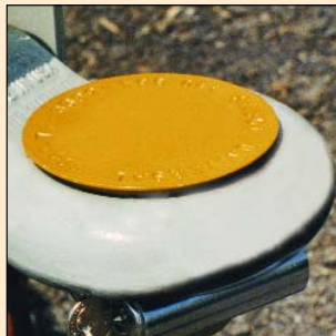
Universal Boot #7 Heavy Duty Pintle Hitch Trailer Lock.