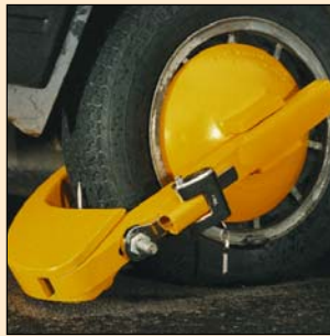
Universal Boot #1 Wheel Immobilizer for Car.