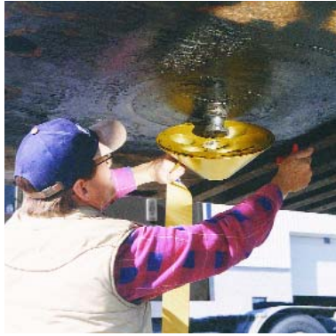
LIFT BOOT AND FIT OVER KING PIN