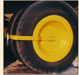
Universal Boot #3 Double Wheel Immobilizer for truck.