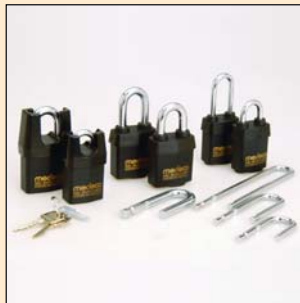
Universal Padlock #9 High Security Medeco Padlocks.