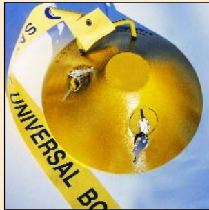
Universal Boot #8D Double locks to double your security.