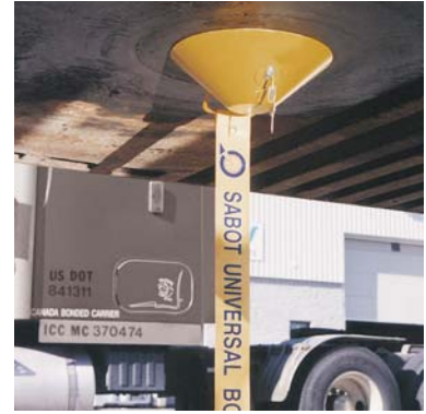
INSERT KEY CYLINDER, LOCK, REMOVE KEY FROM CYLINDER