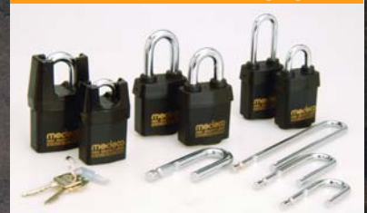
Padlocks with same key system

We deliver the best theft deterrents in the industry.