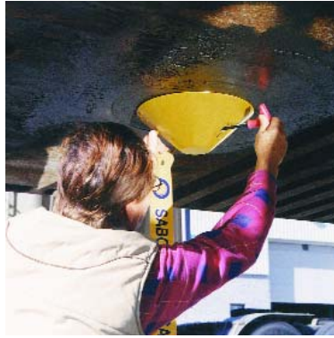
TIGHTEN WITH ALLEN KEY UNTIL SECURED PROPERLY