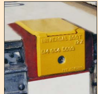
Universal Boot #12 Container Anti-Lifting Protection.