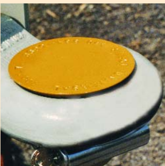
Universal Boot-7 Heavy Duty Pintle Hitch Trailer Lock.