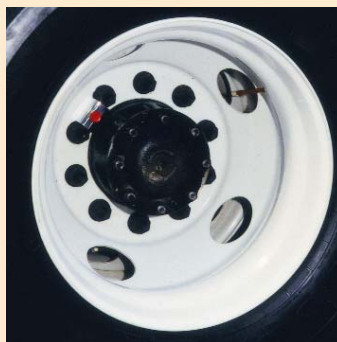
Universal Boot-11 Budd Wheel Lock.