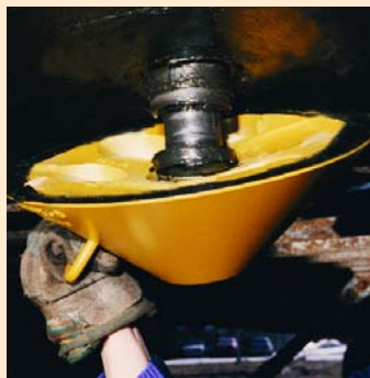
Universal Boot-8 Heavy duty king pin lock.