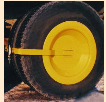
Universal Boot-3 Double Wheel Immobilizer for truck.