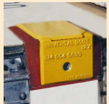
Universal Boot-12 Container Anti-Lifting Protection.